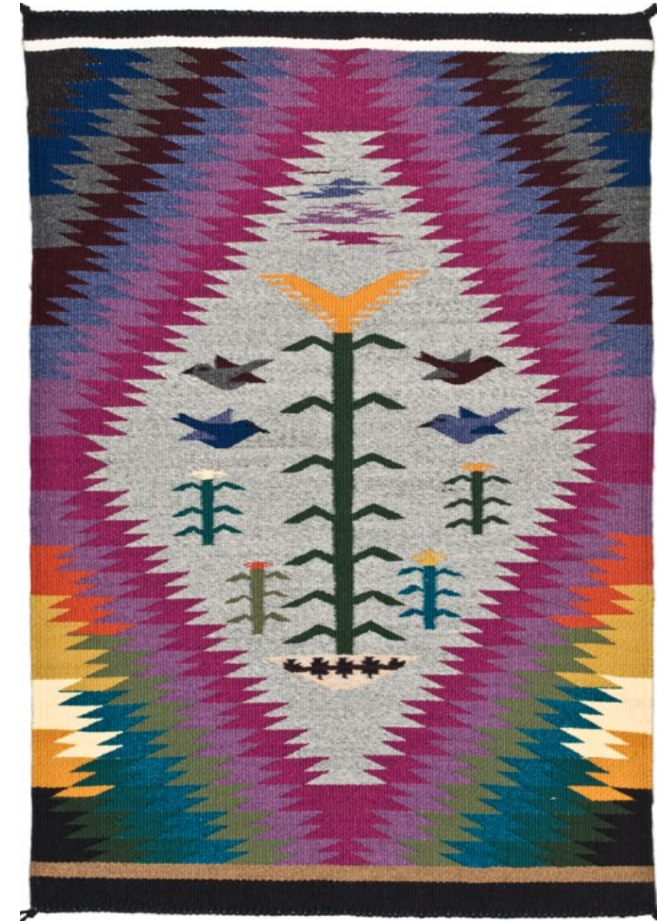
Moon Over The Cornfield 24" x 35"