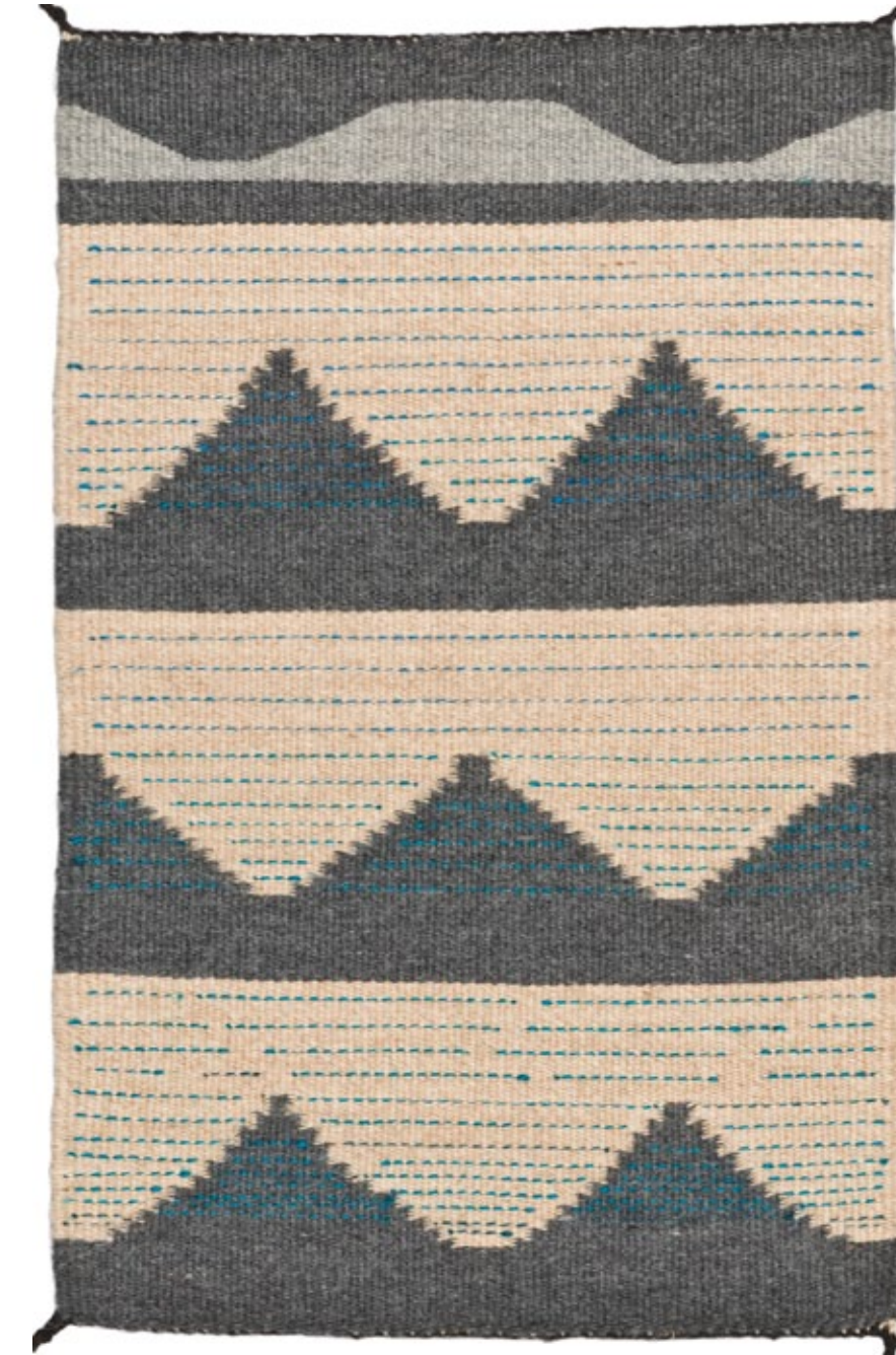
Offerings - Four Directions 16" x 25"