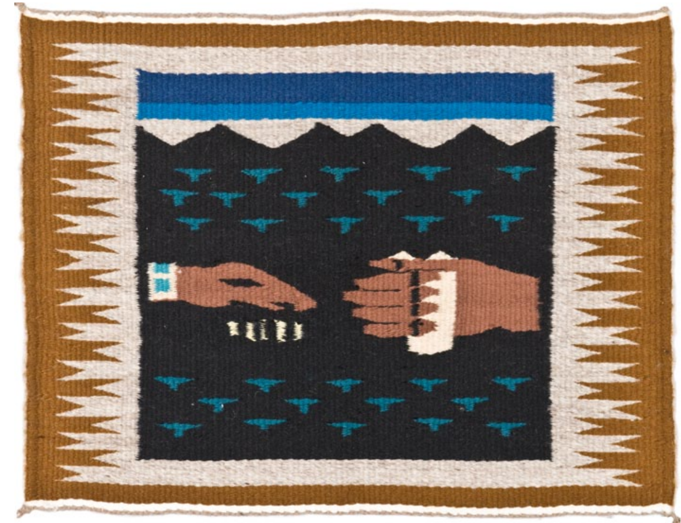
Offerings 19" x 14"

Delorcita, age 51, from Chinle, AZ, is a dedicated weaver, spending eight to ten hours at her loom every day. She typically weaves rugs in the Teec Nos Pos style, complex designs utilizing many different colors. This was her first occasion to weave in a pictorial style which she found to be a challenge.