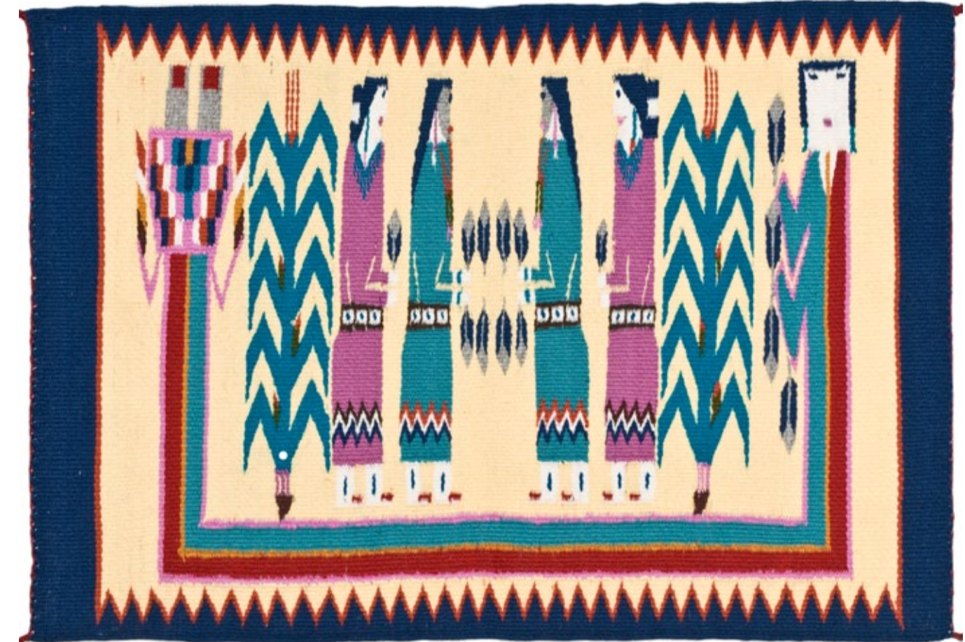
Offerings - Fire Dancers 28" x 20"