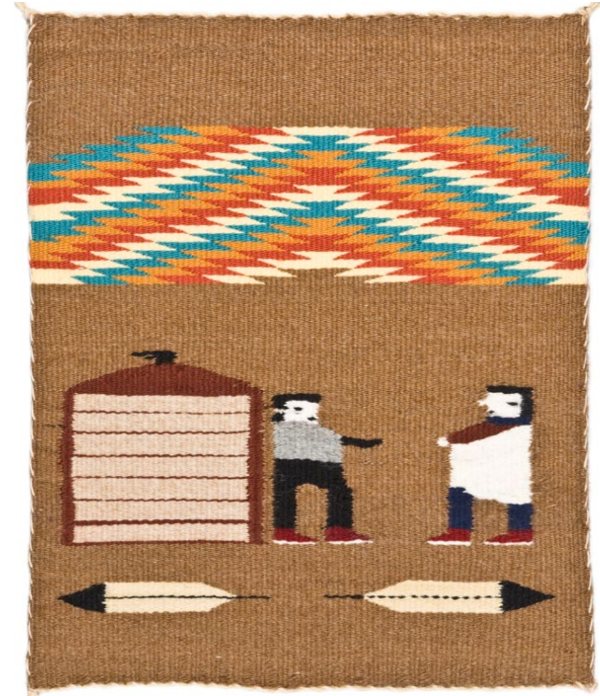
Offerings 17" x 20"

Louise, age 67, lives in Chinle, AZ. Her favorite weaving styles are the Chinle Star pattern and rugs depicting ceremonial Fire Dancers. She likes to use earth colors and gathers wild carrots to produce brown pigments and rabbit brush to make yellows. Louise travels as far as thirty miles to find the wild carrots for her dyes.