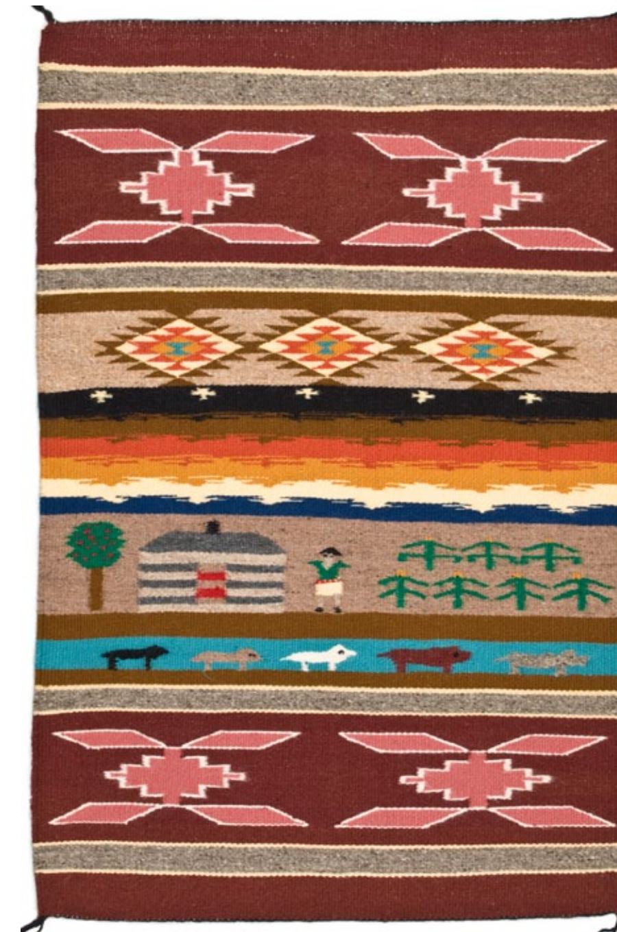
Cornfields 25" x 39"