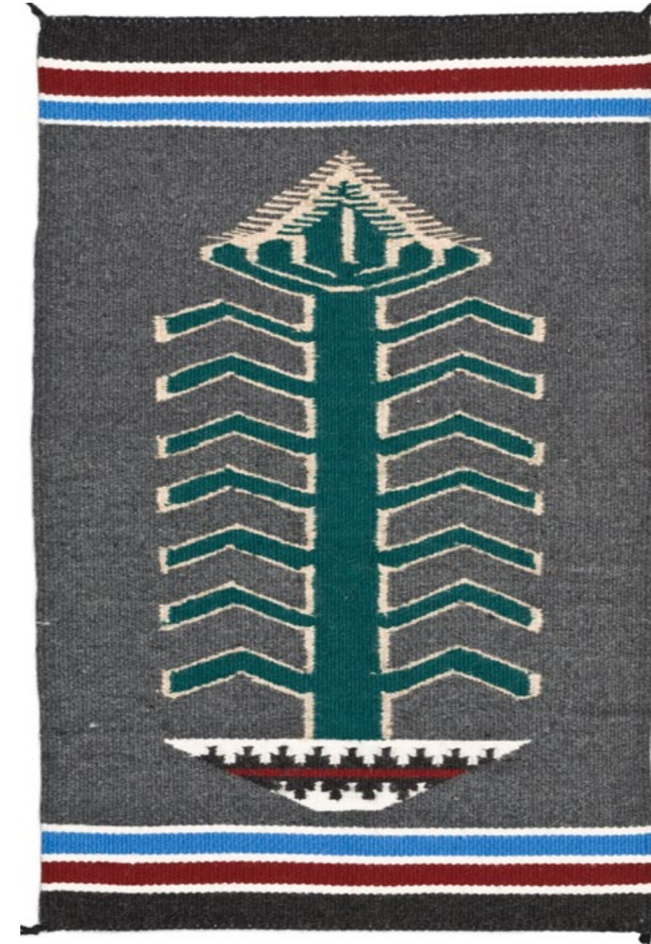
Offerings 18" x 27"

As a weaver, Arlene is self-taught. She is known for weaving the more difficult and challenging rugs and patterns.