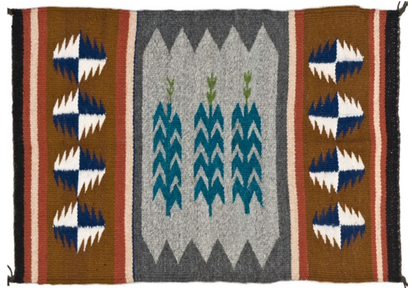
Moon Over the Cornfield 23" x 16"