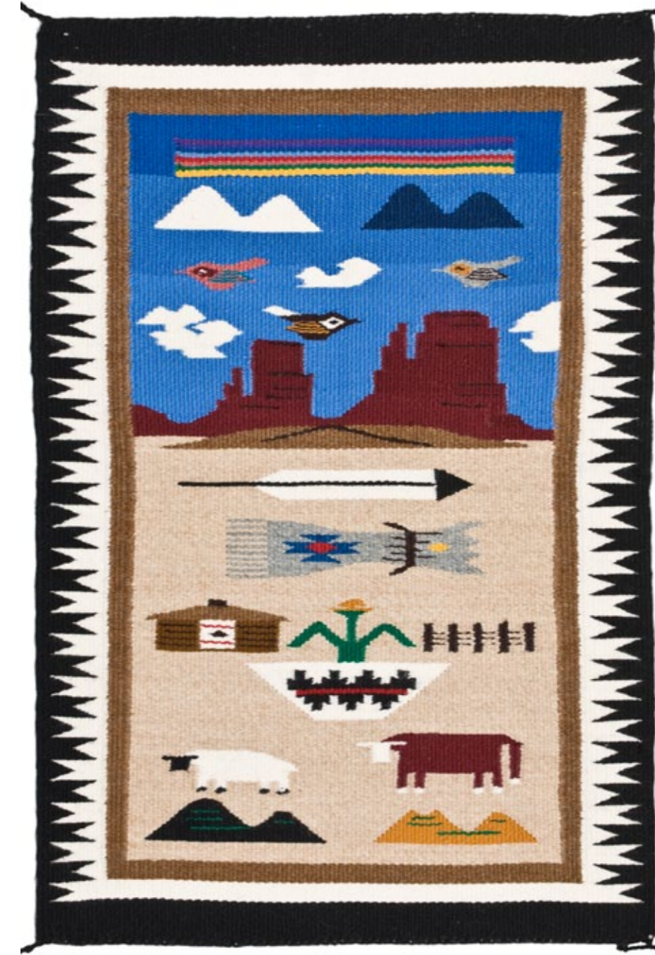
Offerings 20" x 31"