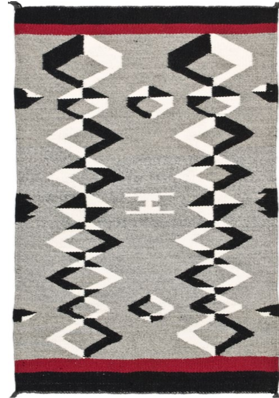
Offerings 20" x 30"