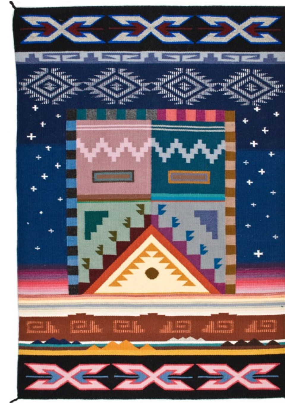
Offerings 33" x 48"