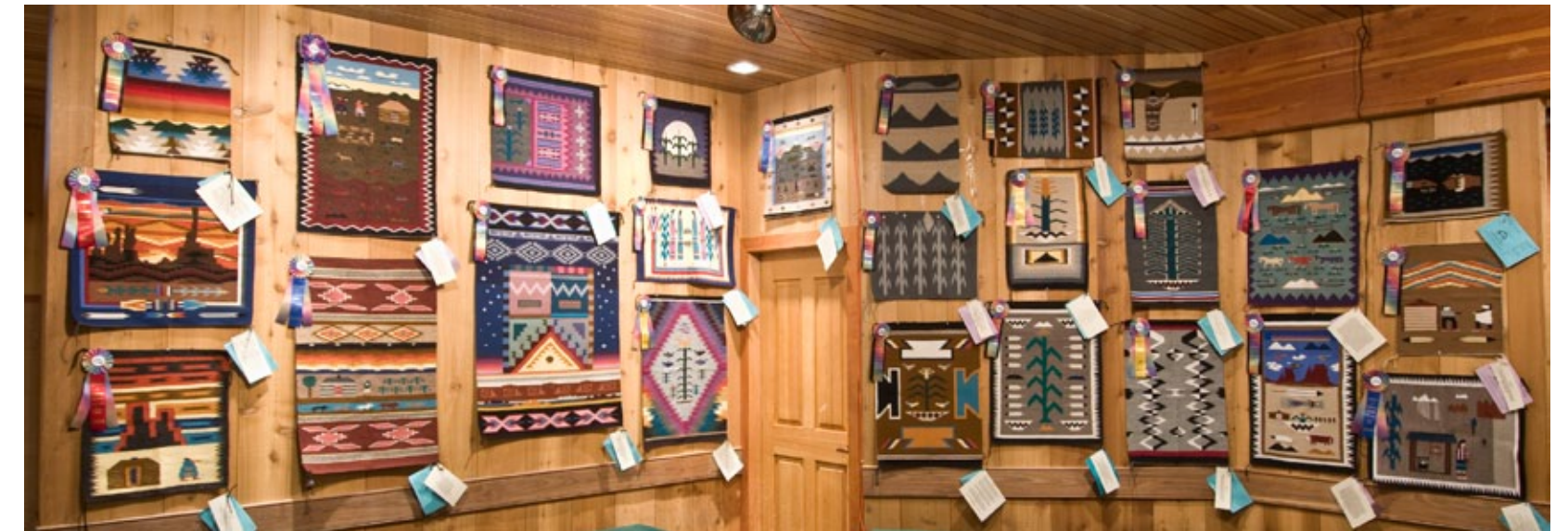
The Rugs on Display