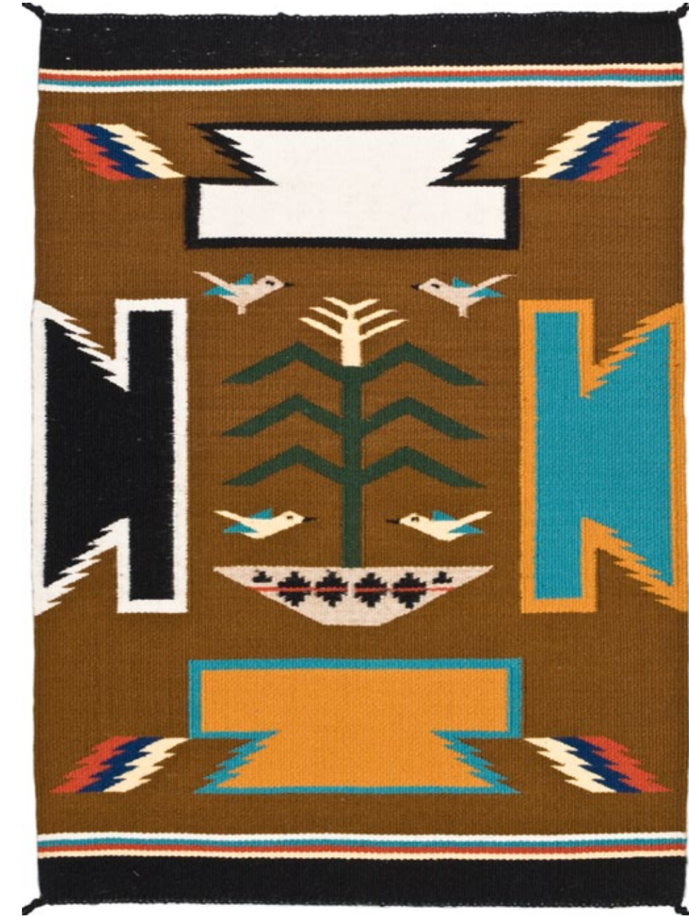
Offerings 23" x 31"

At age 94, Carol, from Forest Lake, AZ, is still riding horses and weaving rugs.