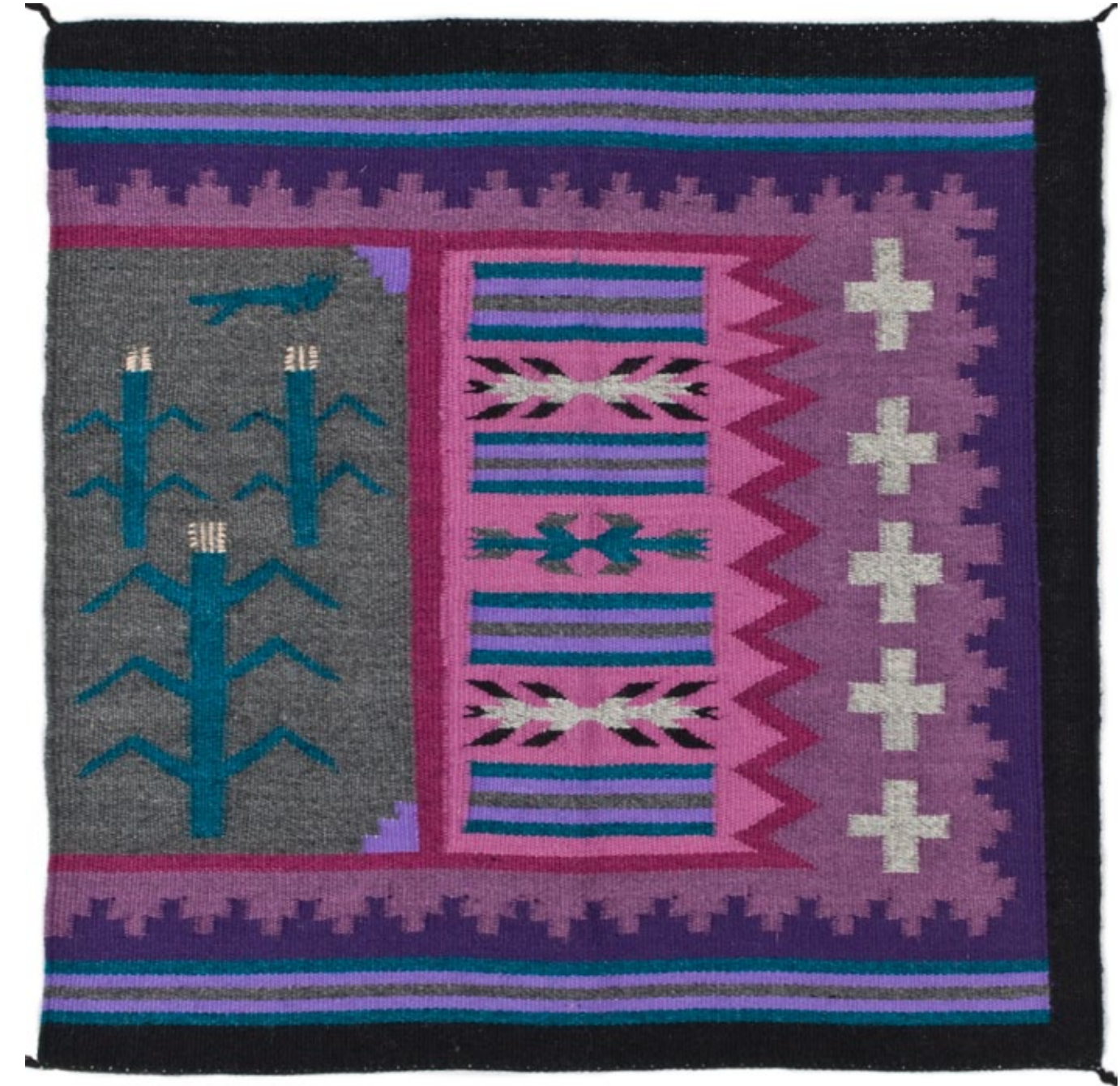
Moon Over the Cornfield 24" x 25"