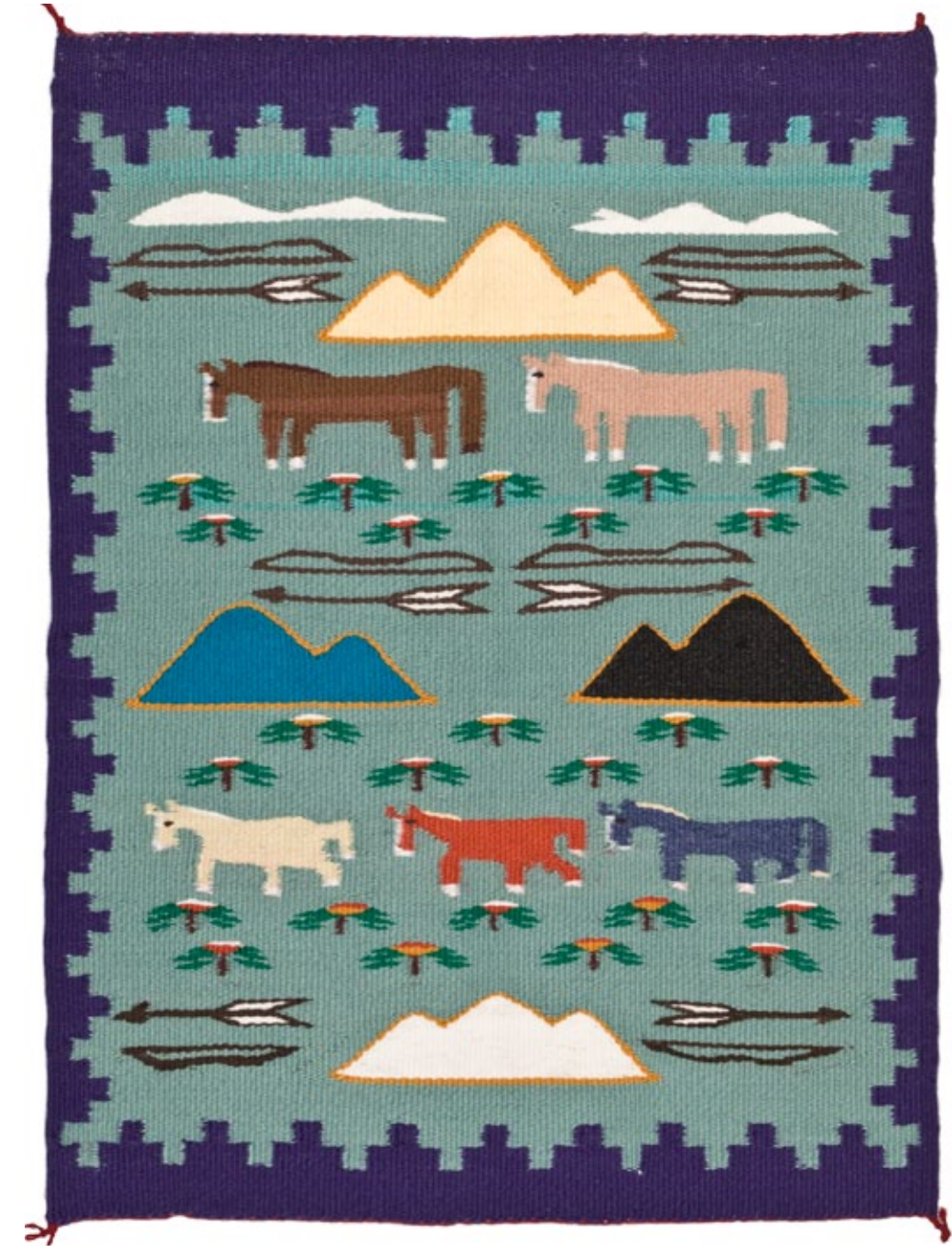
Sacred Mountains 21" x 28"