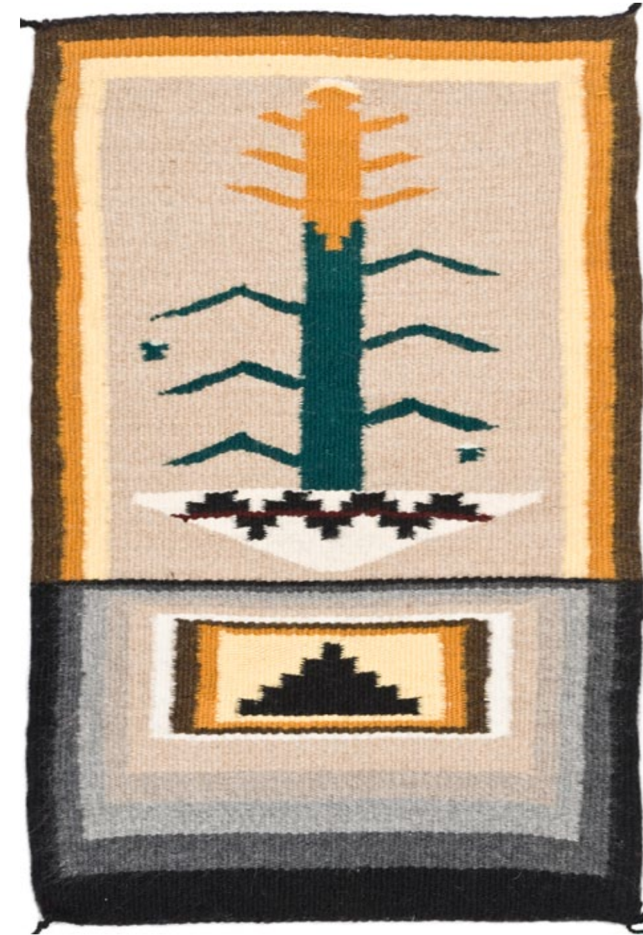
Offerings 17" x 26"